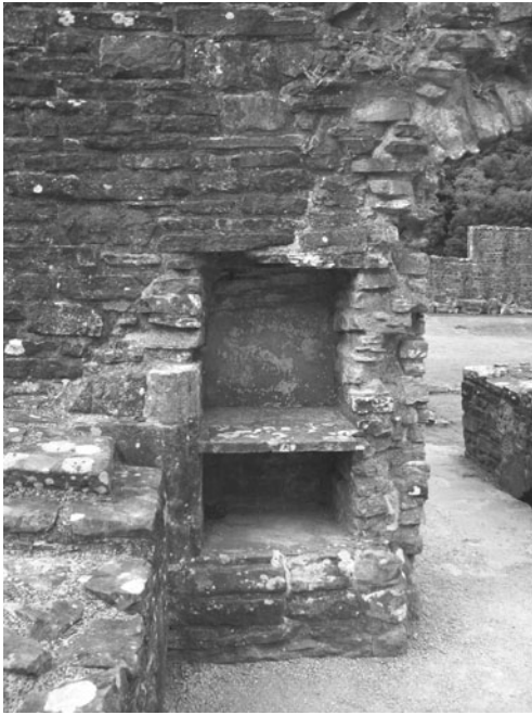
2. Bread oven. Tintern Abbey kitchens, Monmouthshire

hundreds of monks. A kind of production line was established, with some monks mixing the flour and water, others kneading in a kneading-trough, and others putting the loaves in the oven. Making bread was, of course, vital for the maintenance of the community, since it was the staple food. For this reason, it also became a symbol of the community's sense of purpose. The Regulations of Horsiesios , a document that preserves much of Pachomius' original precepts, begins the section on bread-making with the exhortation: 'When the time has come to make our small quantity of bread, all of us, great and little, must work at making bread in the fear of God and with great understanding, reciting the word of God with gravity, without pride, boasting or respect of persons.' All the